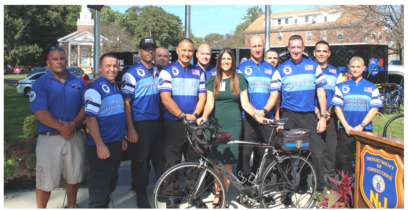
Participants of the Police Unity Tour attended a sendoff ceremony at the Department's Central Office Headquarters in Trenton, N.J.