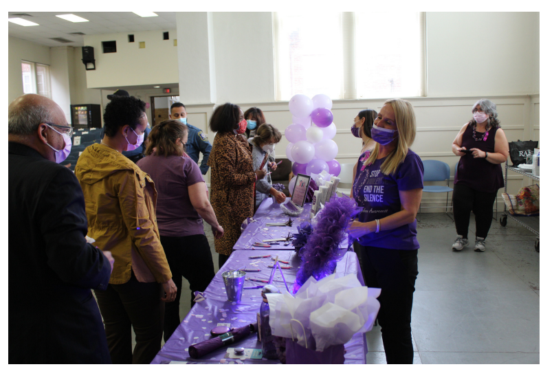
Members of the Workforce Wellness Committee provided information and handed out purple items such as pens and face masks to help bring awareness to domestic violence.