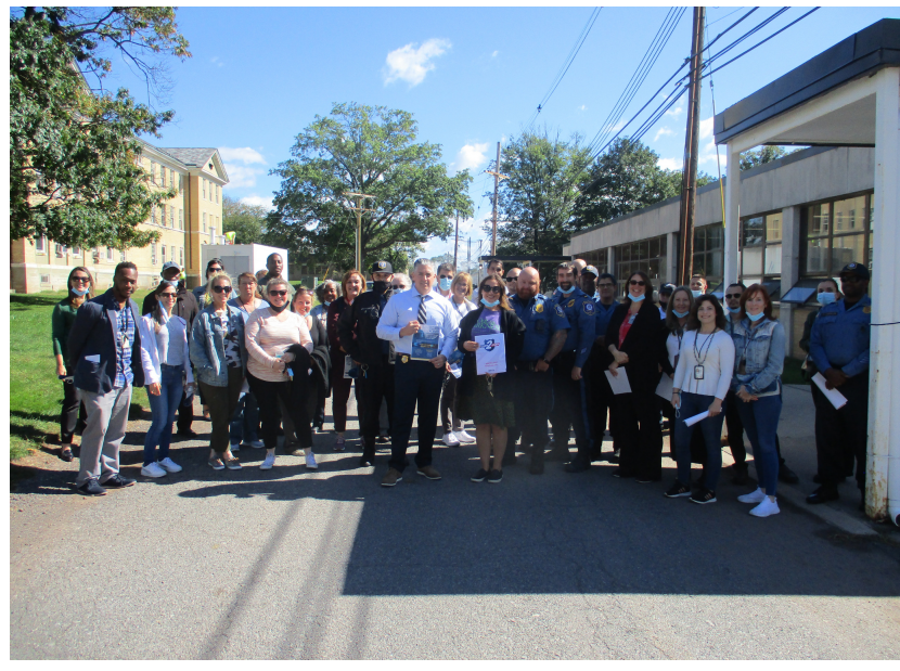
Staff gathered for a picture at the suicide awareness walk held at Edna Mahan Correctional Facility for Women.