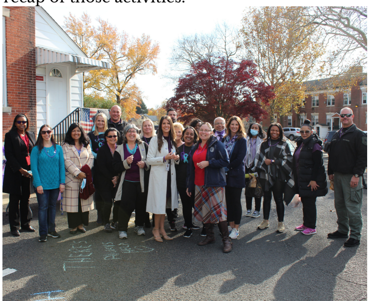
NJDOC Central Office Headquarters staff held a suicide awareness walk on grounds with a table set up providing suicide awareness information.