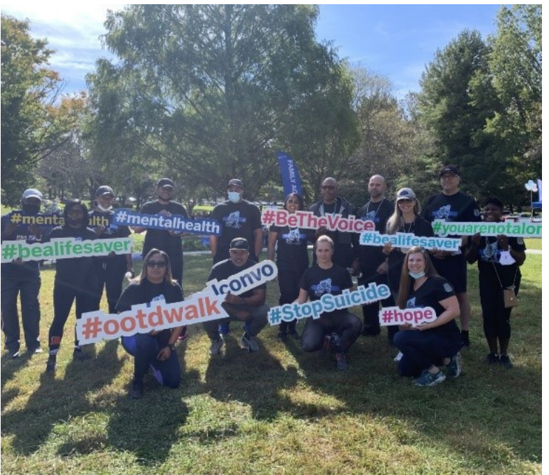
Garden State Youth Correctional Facility Staff poses for a picture while holding social media hashtag signs to raise awareness for suicide prevention.