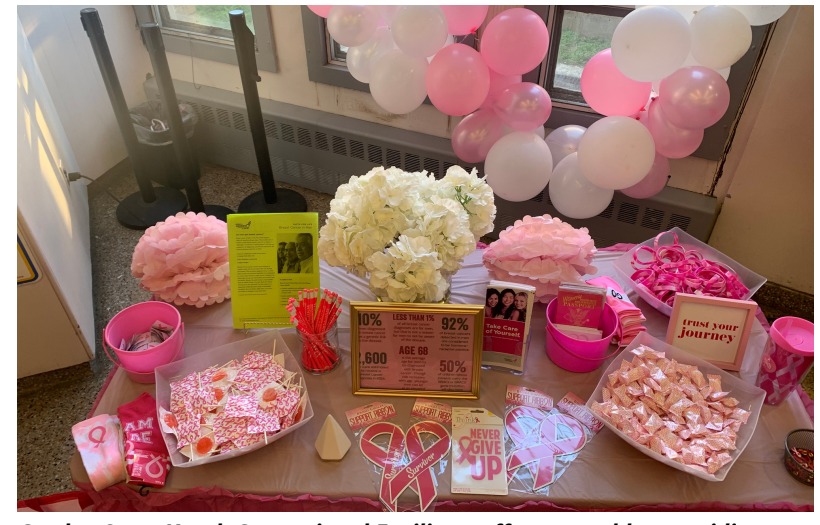
Garden State Youth Correctional Facility staff set up tables providing Breast Cancer Awareness resources for staff.