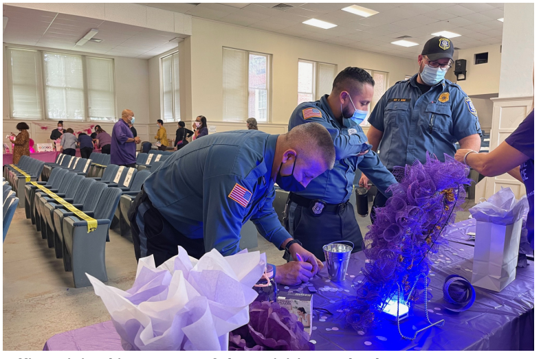
Officers joined in on some of the activities at the day's event.