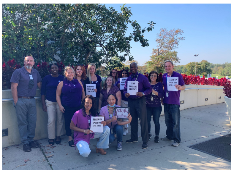
Staff at Garden State Youth Correctional Facility showed their support for Domestic Violence Awareness.