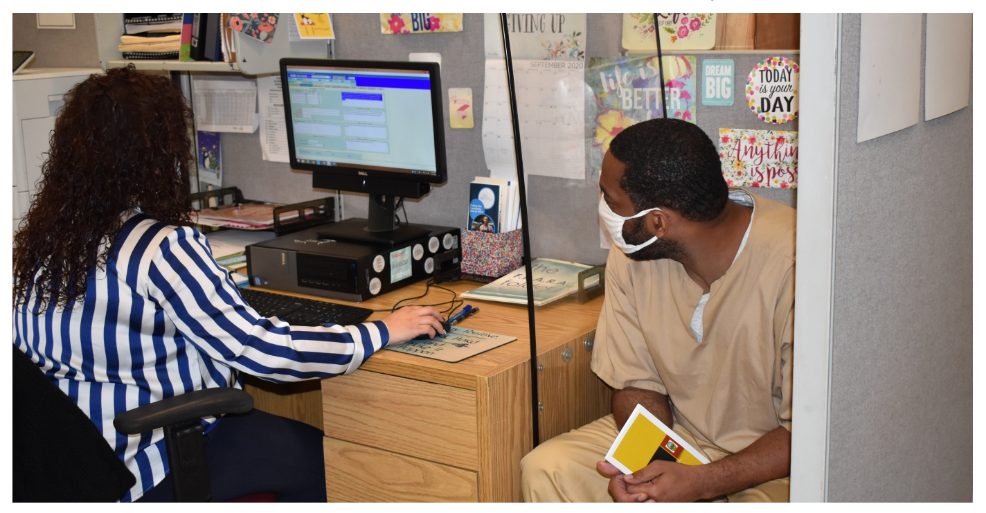
NJDOC Social Services staff meet with individuals to determine post-release needs and provide linkages to community resources.